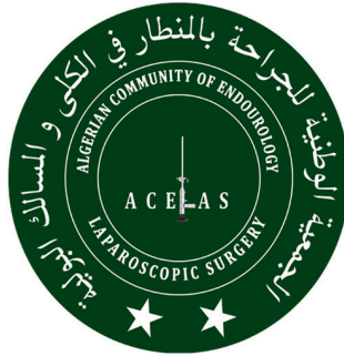
Algerian Community of Endourology & Laparoscopic Surgery " A . C . E . L . A . S "