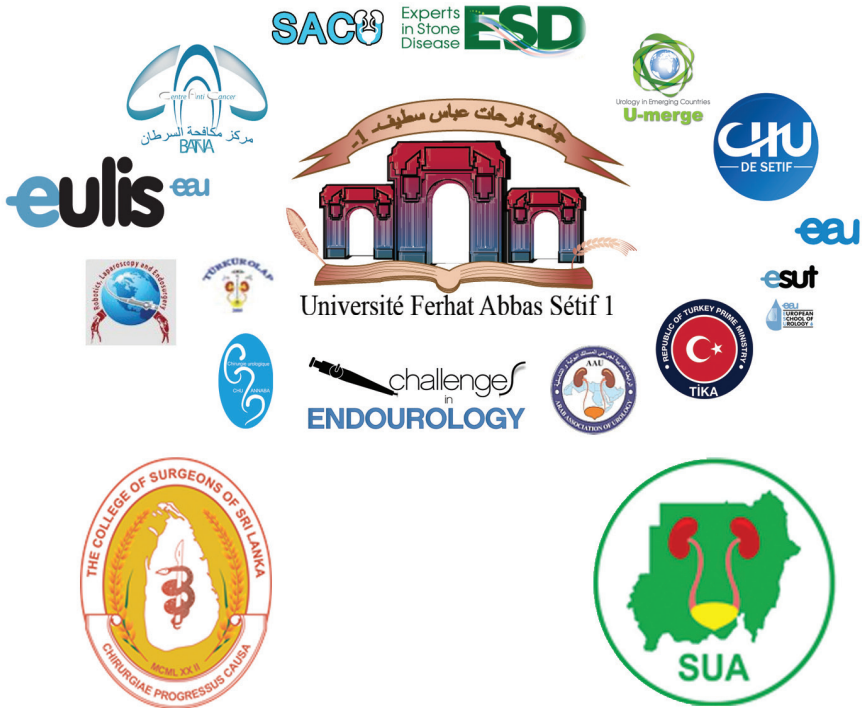
Sudanese urological association